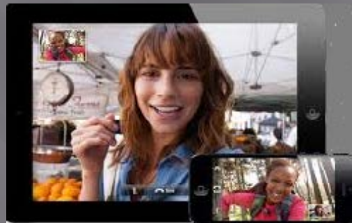
Face-to-face mobile video chat