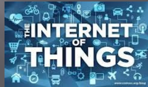
Internet of Everything